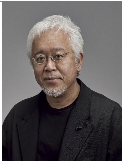
Kenya HARA Designer

Kenya HARA, a distinguished Japanese graphic designer, renowned as the founder and director of Hara Design Institute, has undoubtedly made an indelible impact on the realm of communication design.