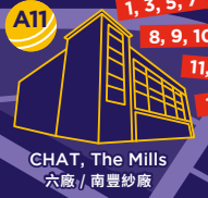
CHAT, The Mills 六廠/南豐紗廠