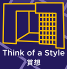
Think of a Style 智想