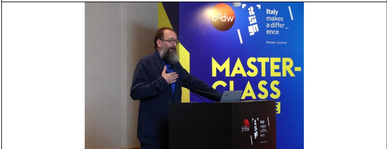
Photo 6: Mr Michele de Lucchi presides over a full house with a private masterclass during BODW 2017

High-resolution images can be downloaded here: