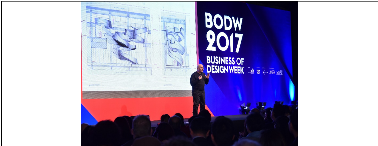
Photo 5: Mr Massimiliano Fuksas, Founder and Principal of Studio Fuksas, speaks at Plenary I of BODW 2017