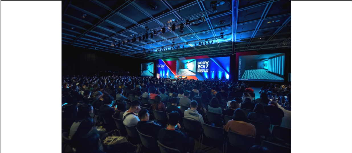
Photo 1: BODW 2017 welcomed more than 70 creative minds across industry and sector to inspire audience in a broad scope of programmes pertaining to design, innovation and brands